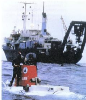
Figure 1-2. A geologist uses special equipment to study erupting volcanoes (left). Oceanographers prepare to enter a submersible to study the ocean floor (above).