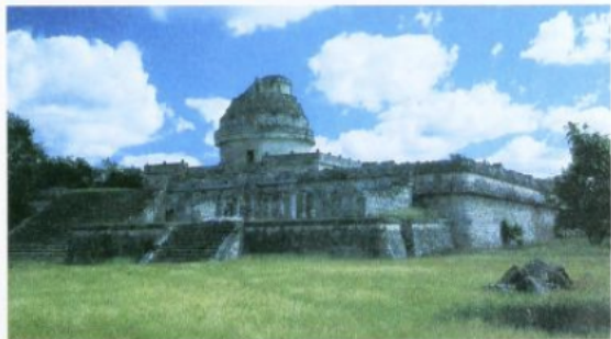
Figure 1-1. El Caracol, an observatory built by the ancient Mayas of Mexico, is the oldest known observatory in the Americas.

As the technology for studying the earth improved, the range of human observation increased dramatically. With the help of special equipment, scientists began to explore the dark ocean depths, the