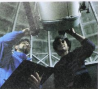
Figure 1–3. Two astronomers use a telescope to observe distant stars (left). A meteorologist uses a computerized system to track storms (right).