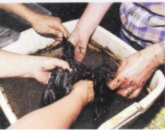
Figure 1–5. People try to help the environment by cleaning up the shore after an oil spill (top). Pollution also harms wildlife. Volunteers remove oil from a bird's feathers (bottom).

rain-forest plants and animals die, their bodies are decomposed by microorganisms. The resulting chemicals enter the soil to nourish other plants and animals. Thus, the system is practically self-supporting. What other examples of ecosystems can you name?