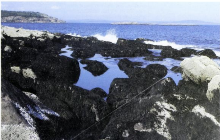
Figure 1-4. This small tidal pool on the coast of Maine, in Acadia National Park, and the vast ocean are both ecosystems.