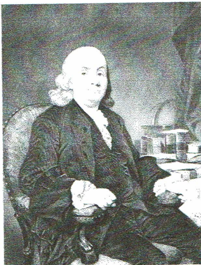
Benjamin Franklin died in 1790.

He came up with some ideas as a politician that we still use today. He decided how we could elect the people who make our laws. He also signed the Declaration of Independence, and that was when the United States was born.