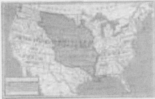
1903 map of the Louisiana Purchase from the U.S. Department of the Interior

In 1803, President Thomas Jefferson completed a treaty with the French government to purchase a large section of land in North America. This land is now known as the Louisiana Purchase. The purchase was important to the future of the U.S. It was the first major expansion of the U.S. since it had won its independence from Great Britain 20 years earlier. The territory gained in the Louisiana Purchase was the largest in U.S. history, totalling 828,000